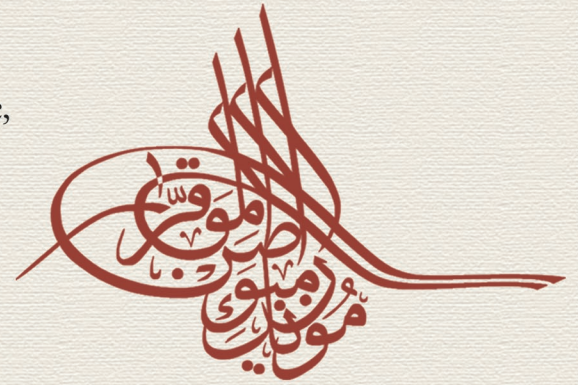
Sun Myung Moon in Arabic, "Tughra" style

One can reflect on each of the pictures, as they reveal their beauty and wisdom brush-stroke by brush-stroke.